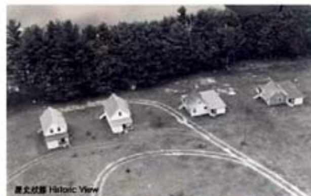
历史风貌 Historic View