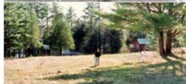
现有状况 Existing Conditions

簡潔的對角軸線演繹純粹的景觀藝術，詩意的設計手法渲染出獨一無二的景觀意境。徑流排水系統與經濟性主題的綜合應用節儉而不失優雅。這些微妙的改善賦予場地強大的特色，這處營地景觀對遊人的重要性由此可見一斑。